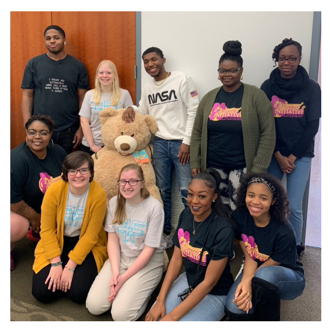
Norfolk State University Hour 2 Empower, January 2020